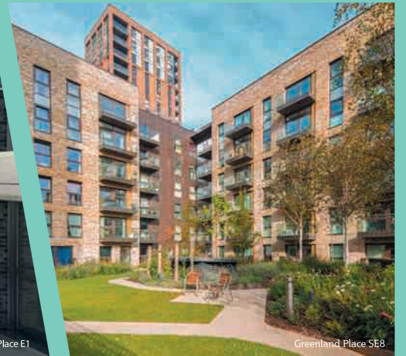
Greenland Place SE8