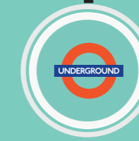
London City Airport 33-minute Tube