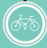
'Greenway' cycle path 8-minute cycle