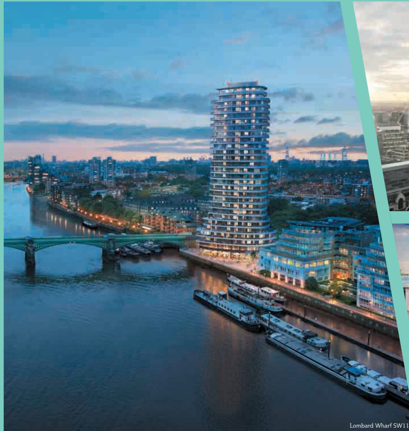
Lombard Wharf SW11

*We are the only major national housebuilder to be awarded this award 10 years running. "we" refers to the Barratt Developments PLC group brands including Barratt London, Barratt Homes and David Wilson Homes.