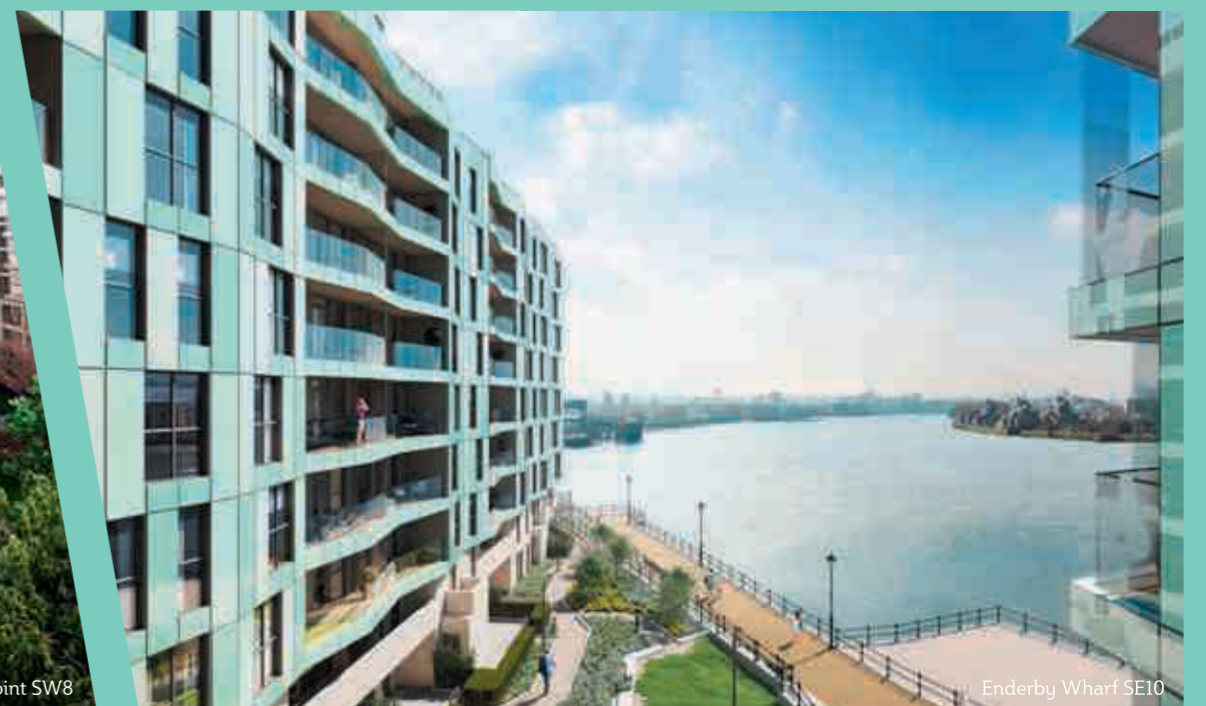
Enderby Wharf SE10