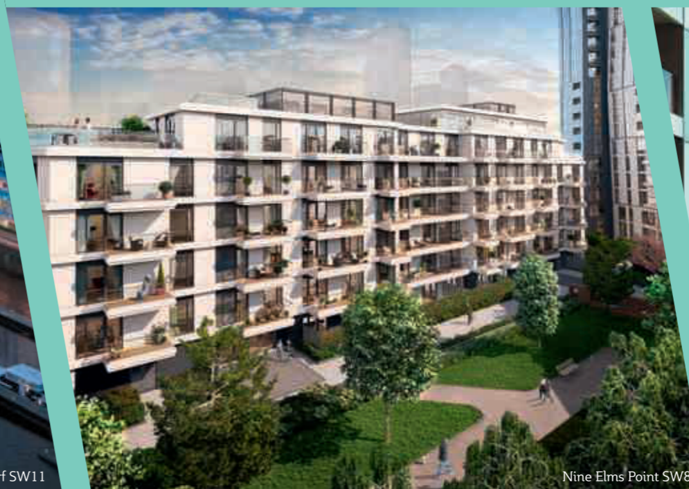
Nine Elms Point SW8