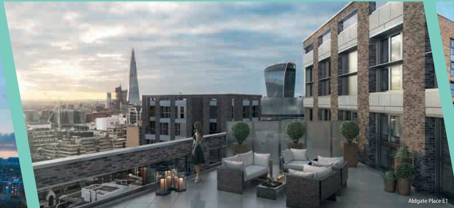
Aldgate Place E1